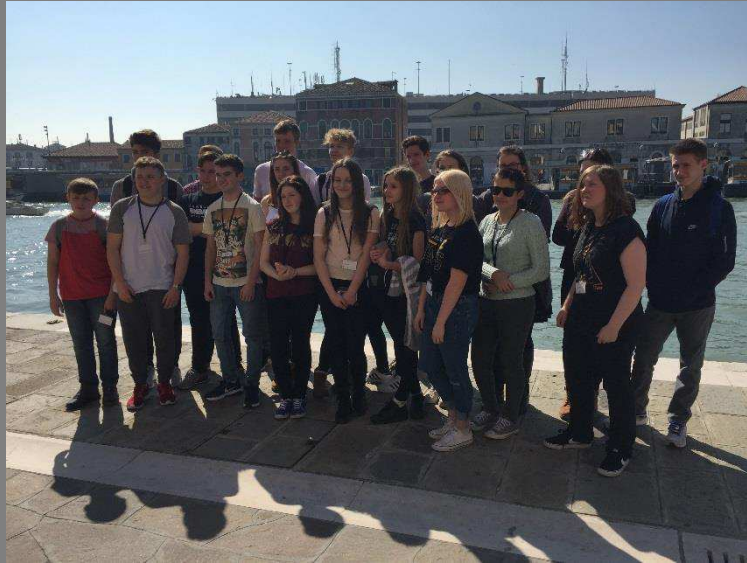
The Grand Canal!

The students will be giving House Assemblies to inform the Academy about their experiences. Parents welcome.