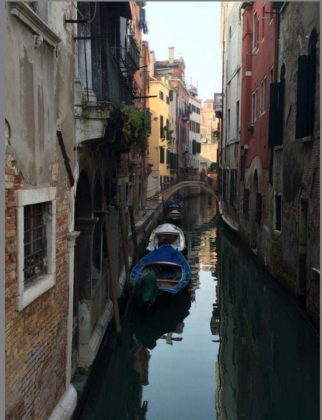
A Venice Street!