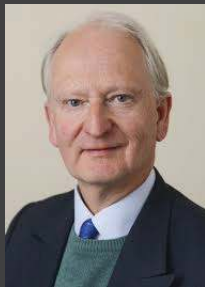
Leave: Sir Henry Bellingham, Conservative MP for North West Norfolk